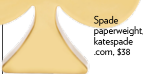
Spade paperweight, katespade.com, $38

Get a winning look with playing card-inspired accessories.